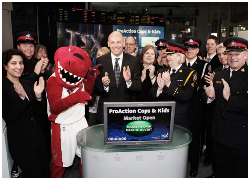
ProAction Cops & Kids opens the TSX on March 10, 2009